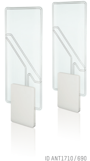
ID ANT1710 / 690